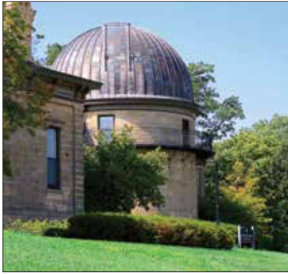
Late summer at Washburn Observatory